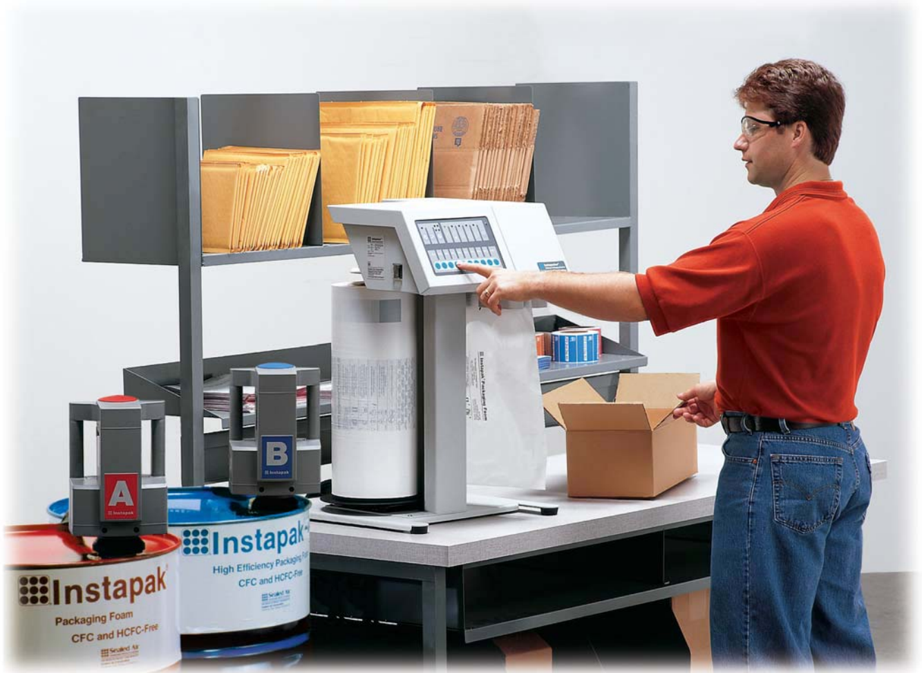
Workbench, Instapak® chemical drums and film not included.